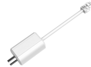
LR1002 ePoE Over Coax Converter